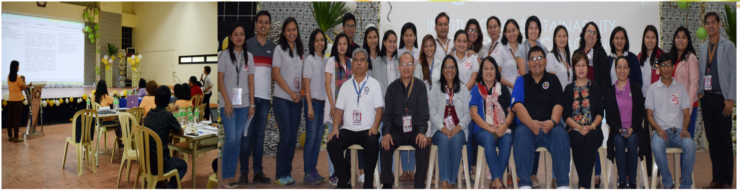
The presentation of outputs was facilitated by the CHEDRO V Quality Assurance Team (left) The ISA task force which consists of faculty members from delivery units, together with VPAF, VPRE and VPAA, successfully finished the ISA Coaching Workshop (right)

The Commission on Higher Education Region V (CHEDRO V) Quality Assurance Team conducted the Institutional Sustainability Assessment (ISA) Coaching Workshop on February 13-14, 2018 at the CNSC Social Hall, Main Campus, Daet, Camarines Norte.