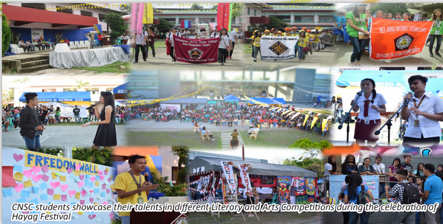
CNSC students showcase their talents in different Literary and Arts Competitions during the celebration of Hayag Festival

To strengthen the richness of culture and arts of Camarines Norte State College, the institution celebrated the Hayag Festival on February 21-23, 2018 at the Main campus. This was participated by the faculty and students from different campuses.