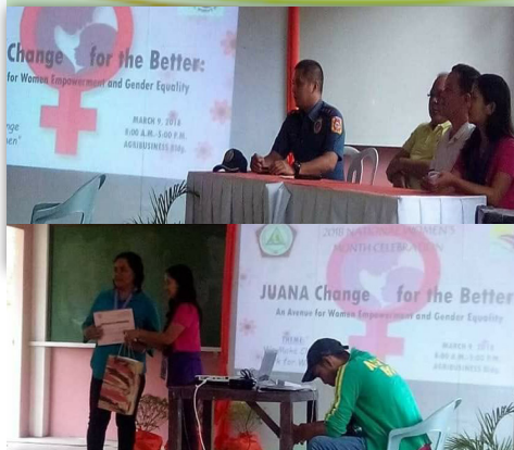
The resource speakers during the National Women's Month Seminar in IABD titled "JUANA Change for the Better: An Avenue for Women Empowerment and Gender Equality"

Institute of Agri-Business and Development (IABD) through the Gender and Development (GAD) Office conducted series of activities in consonance with the month long celebration of National Women's Month in March 2018.