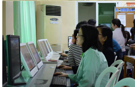
CNSC faculty, non-teaching personnel and students browse the new E-resources of the CNSC Main Library during the orientation of CE-Logic

available through subscription or be perpetual in nature. Among the many advantages of E-resources are: it is not a threat to traditional library resources but a solution to current problems by global libraries like deterioration of materials, lack of space for expansion and growing demands for its services to be readily available; it solves the problem of cost since most traditional resources come from different parts of the world and incur delivery costs; it does not depreciate; information is available 24/7 even holidays; it is cost effective because the volume of users decreases the marginal cost of the resources; it is modern and adapts to the current trends and it has no boundaries; and it can obtain resources from sources that are not physically adaptable or reachable.