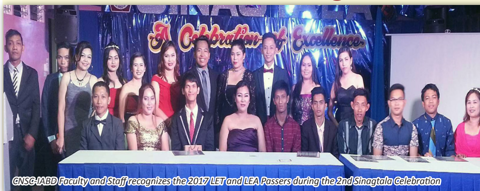
CNSC-IABD Faculty and Staff recognizes the 2017 LET and LEA Passers during the 2nd Sinagtala Celebration

Sinagtala, an annual tradition of the campus which is anchored on the enshrined motto of the college – ONE CNSC – was conducted on March 22, 2018 at the Institute of Agri-Business and Development Agri-Business (IABD) Building. It aims to gather the graduating students, student-achievers, board exam passers, faculty and personnel as they celebrate a year of success and excellence.