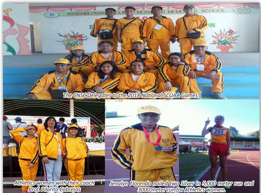
The CNSC Delegates to the 2018 National SCUAA Games.